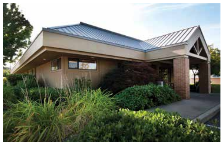
Asante Physician Partners Family Practice Clinic, Talent